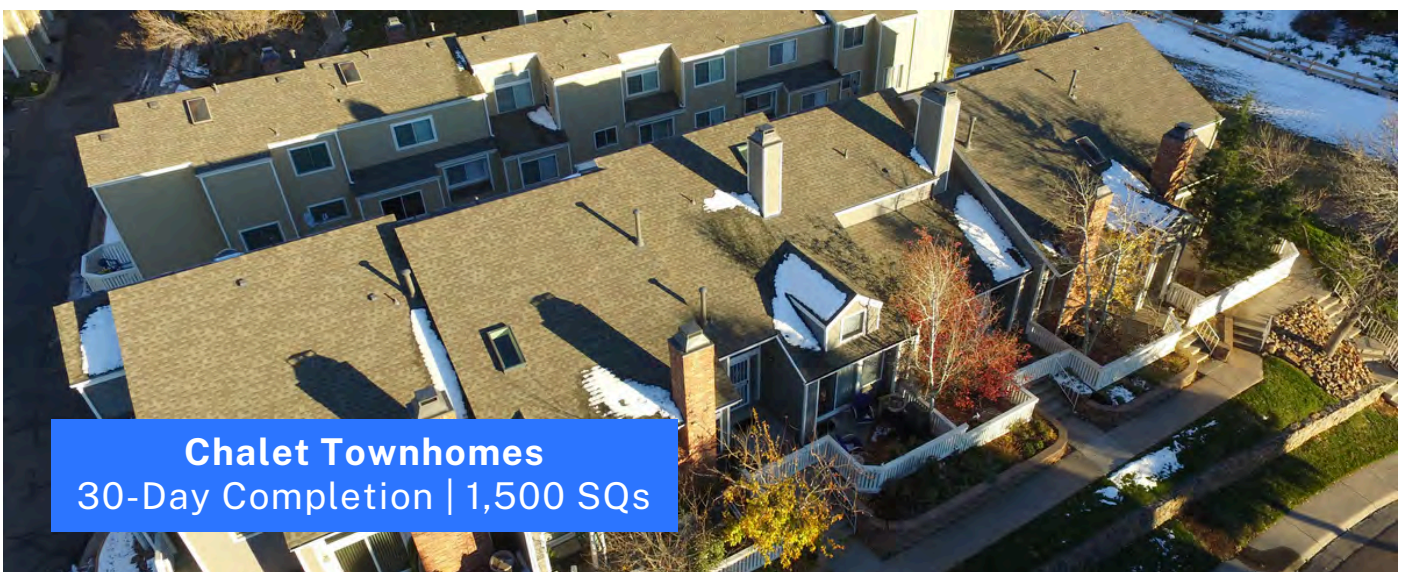
Chalet Townhomes 30-Day Completion | 1,500 SQs