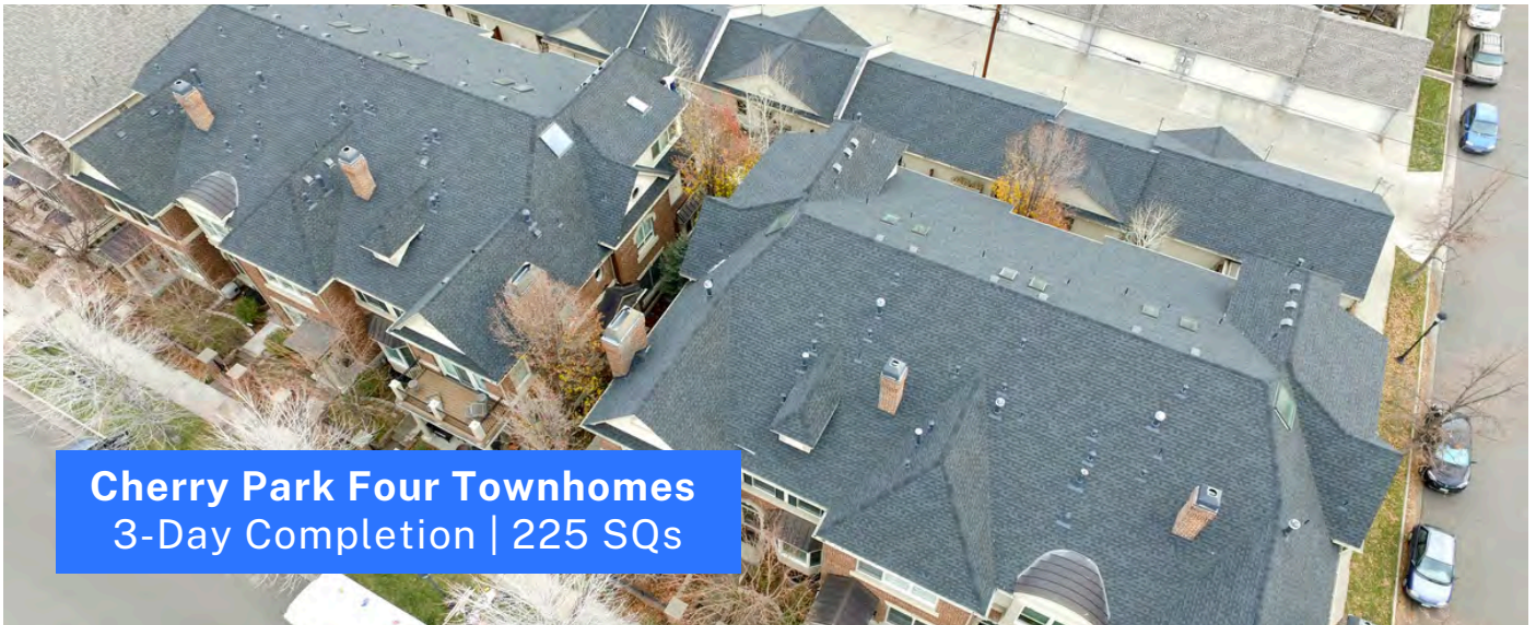
Cherry Park Four Townhomes 3-Day Completion | 225 SQs