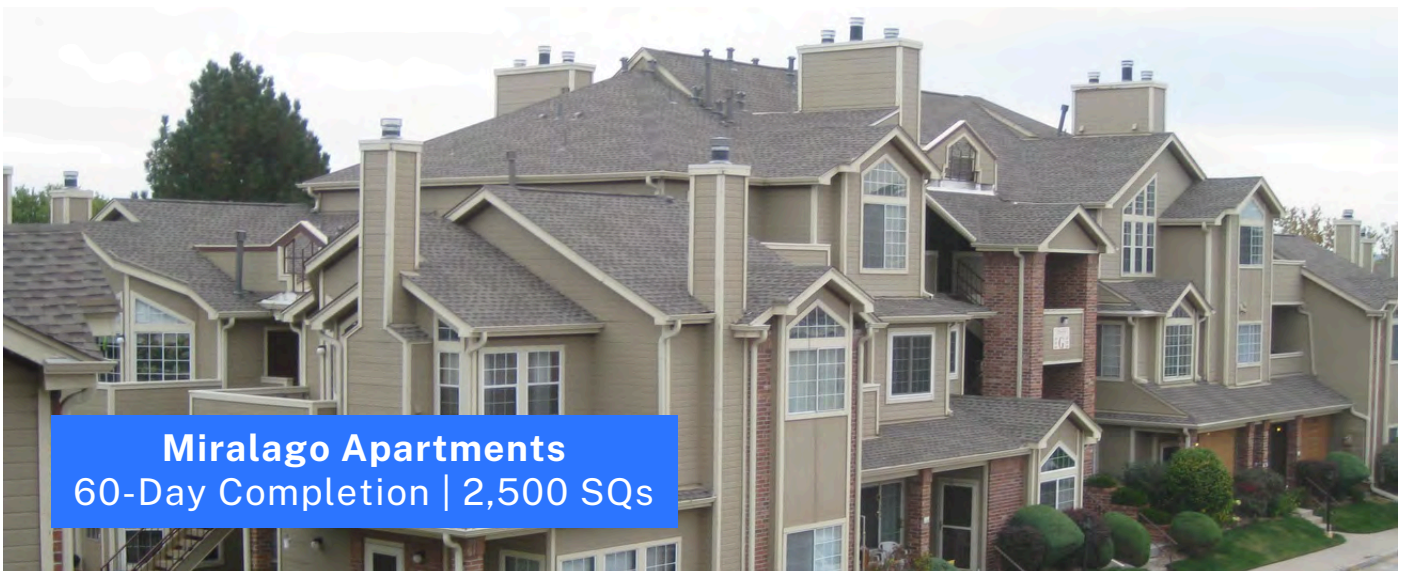
Miralago Apartments 60-Day Completion | 2,500 SQs